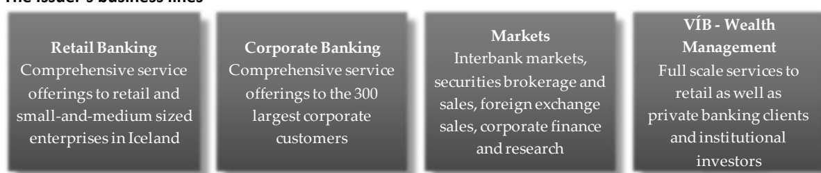
Figure 1: Issuer's business lines