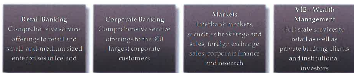
Figure 1: Issuer's business lines